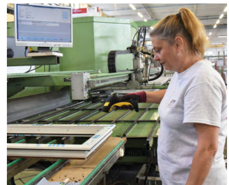
At TMP, there are almost no production workstations that are not incorporated into the networked production with A+W Cantor CIM

chine technologies controlled by state-of-the-art industry software. Paper at TMP? That’s so yesterday. Today, A+W Cantor CIM monitors and barcode scanners reliably provide the right information at the right time, they enable real-time status messages and they help automatically initiate production processes. The barcode label includes all information required for the quick and reliable handling of all production processes.