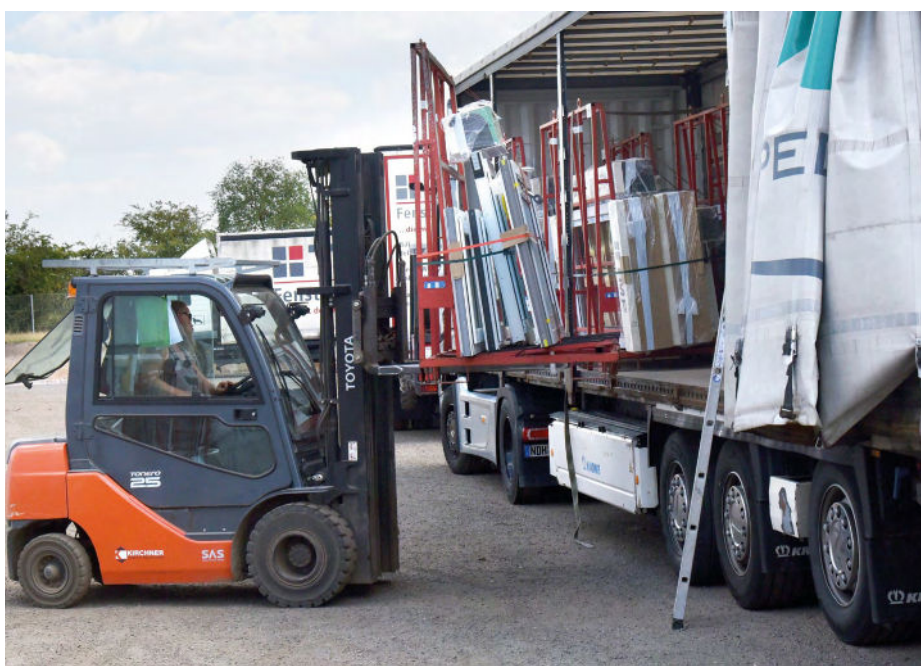
Finished products that were stored in the logistics center are loaded for delivery to customers. The forklifts are equipped with notebooks so that forklift drivers know exactly where they're going.

carries stacks of paper or material through the production hall. Even at manual processing stations, information is provided by A+W Cantor CIM monitors; true-to-scale graphics help the workers with manual steps. Production control is coupled seamlessly with the A+W Cantor ERP system, the commercial-administrative part of this comprehensive corporate solution. All order data is available shortly after entry and scheduling all across the company. Status reports are sent from production to the A+W Cantor ERP system and ensure maximum transparency. Control instructions for production are transferred from the ERP system in real time – the user in production sees only what he needs to see thanks to this high-end IT system: each workstation can be configured individually.